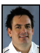
Porter - AUS

Leading scorers: Shingo Fujishima (20 goals); HAN, Guifei (13 goals)