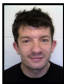
Ash – GBR