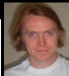
Video / Technical Staff

Place of Birth: Date of Birth: Hometown: Residence: Started in rugby: With Nat. Team since: Home Club: Languages spoken: German, Occupation: Hobbies: Goals: Recent activity with team: 2005 European Championships (Support) 2004 Paralympics Games (Support)